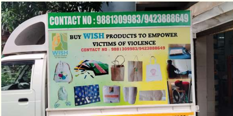
Diverse fabric and paper products at WISH