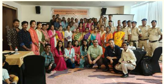
Successfully engaged government and community stakeholders to combat Child Sexual Abuse and Sexual Exploitation