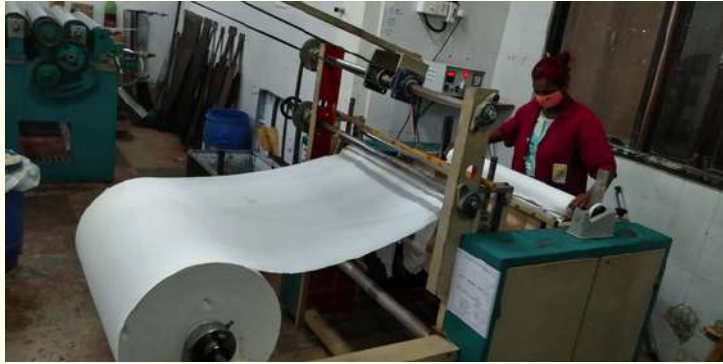
Paper Bags, Tissue Paper and Rolls