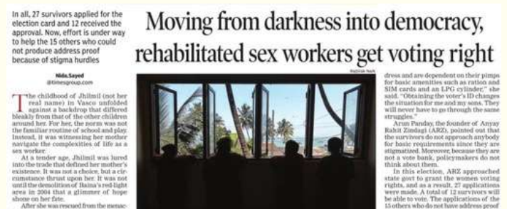
Ensuring that the women engaged in commercial sexual activities get their rights