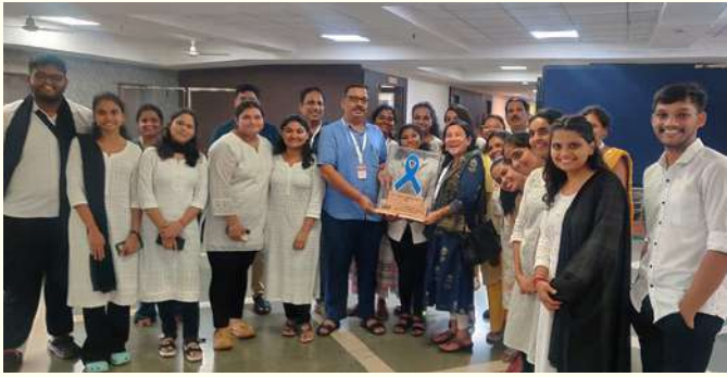
ARZ started the World Day Against Trafficking Rolling Trophy to be held every year