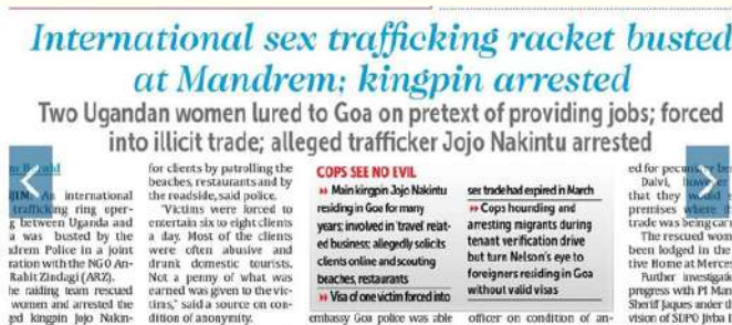
ARZ in collaboration with Goa Police busted an international sex trafficking racket arresting the king pin and rescuing the victims