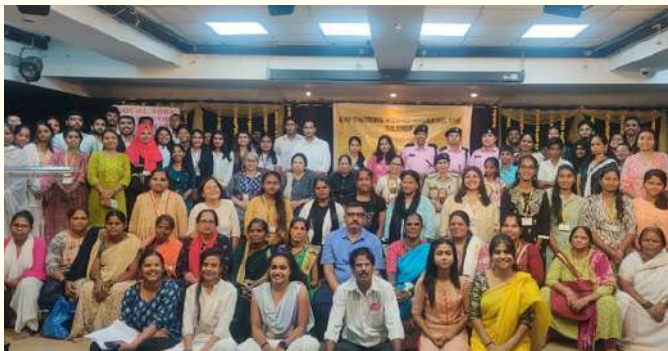
State-Level Meet to tackle the issue of domestic violence in Goa held on International Women's Day