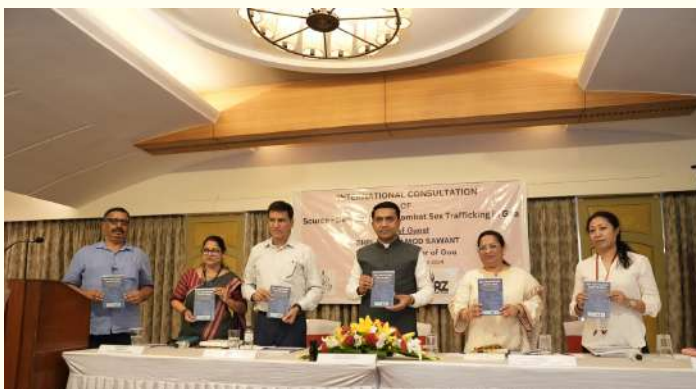
Report on CSE in Goa (2019-2024) and Handbook for service providers on Sex Trafficking Laws in India released by Hon'ble Chief Minister, Dr. Pramod Sawant